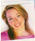
EDITED BY JULIE HAMILTON